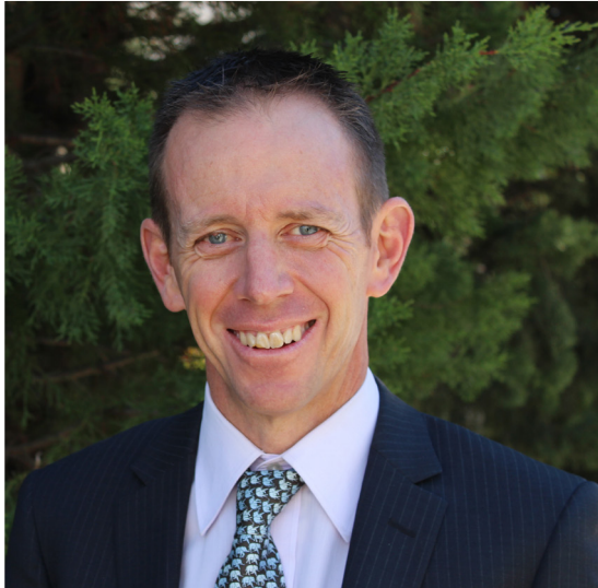
Shane Rattenbury Minister for Climate Change and Sustainability