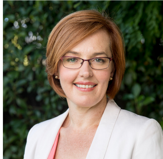
Meegan Fitzharris Minister for Transport and City Services