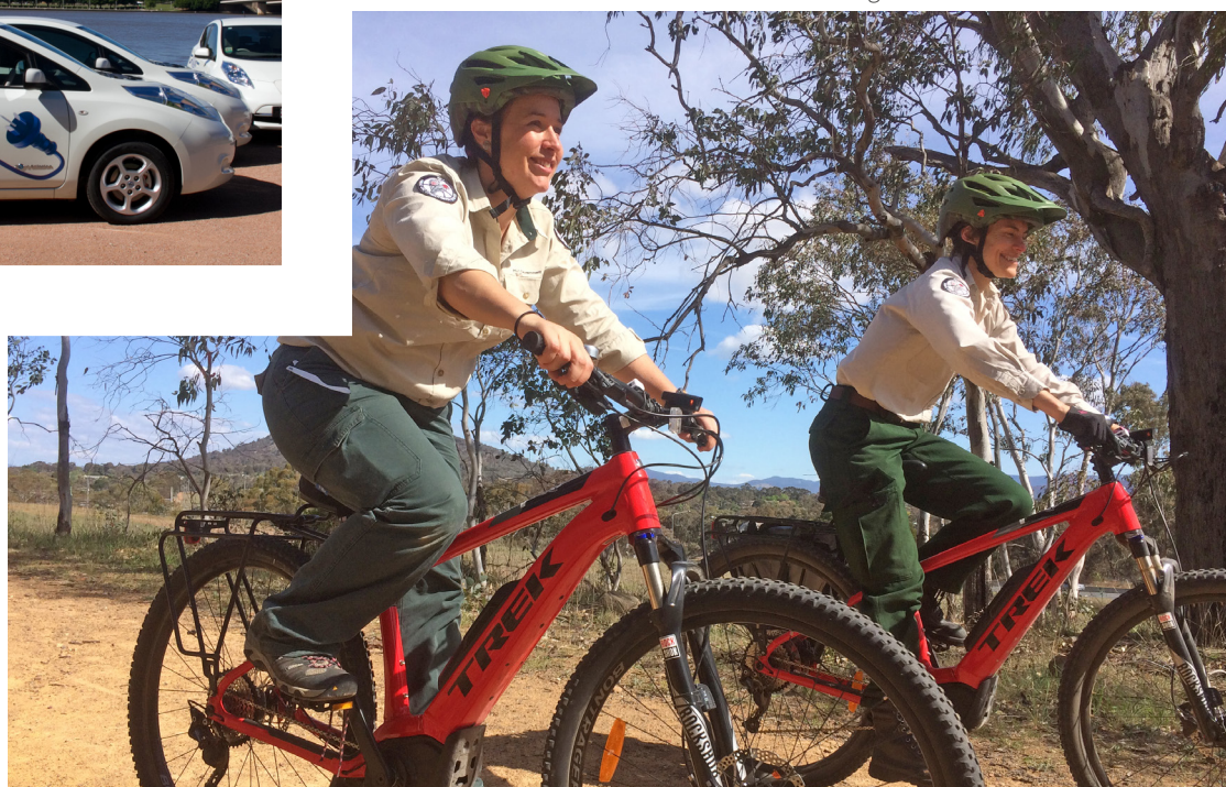
ACT Parks and Conservation Service staff traveling on work e-bikes