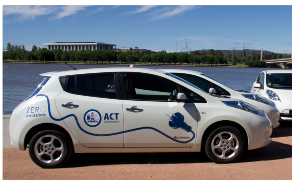
ACT Government electric vehicle fleet