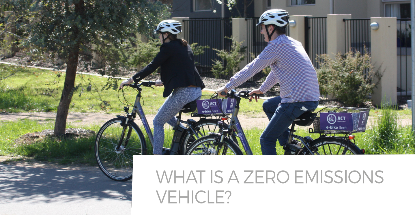
ACT Government staff traveling for work on e-bikes