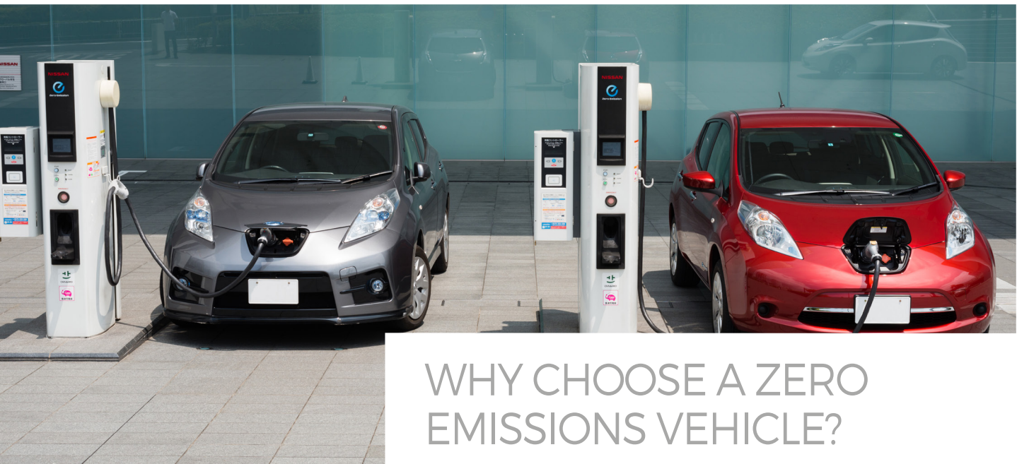
The ACT has a network of 20 public charge points for electric vehicle owners